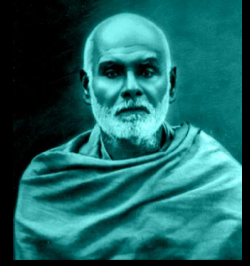
SREE NARAYANA GURU SNA's Guiding Light

SNA operates as an open organisation for intercultural learning activities, extending membership to those resident in the Greater Toronto Area ('GTA') and neighbouring areas.